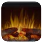
Also available with Inner Glow Logs: S5GFP-300-B