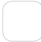
Also available in White finish: S5GFP-300-W | Acrylic Ice SAP5L-300-W | Inner Glow Logs