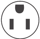
Plug Type (NEMA) 5-15P

1 Warranty 5 year sealed system / 1 year full parts and labor.